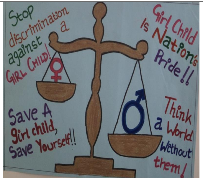
Issued in public interest by Govt. of India